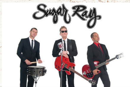
Sugar Ray Saturday, Aug. 10th