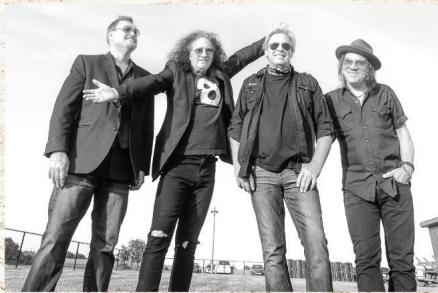
The Georgia Satellites Thursday, Aug. 8th