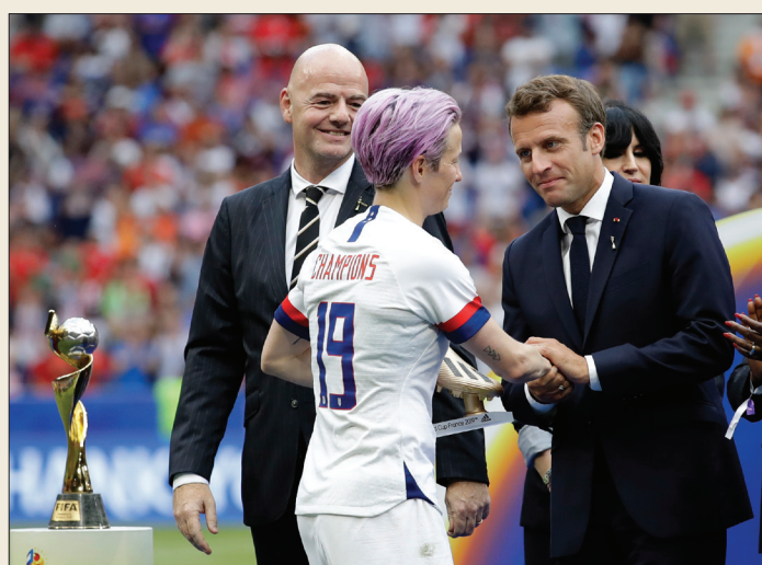
French President Emmanuel Macron, right, and FIFA President Gianni Infantino, left, congratulate United States' Megan Rapinoe, center, after the Women's World Cup final soccer match between U.S. and The Netherlands in the Stade de Lyon in Decines, outside Lyon, France, on July 7, 2019.