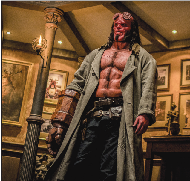
David Harbour stars in "Hellboy"

After defeating the enormous beasts, Hellboy learns that he is the descendant of King Arthur and that it's up to him to use the sword Excalibur to save London