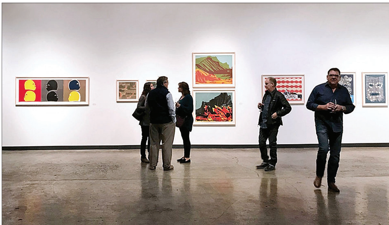
A Crow's Shadow Institute of the Arts exhibition at Foundry Vineyards Gallery in 2018. The Walla Walla venue will host the July 27 Crow's Shadow Gala & Art Auction featuring works from Monothon 2019.