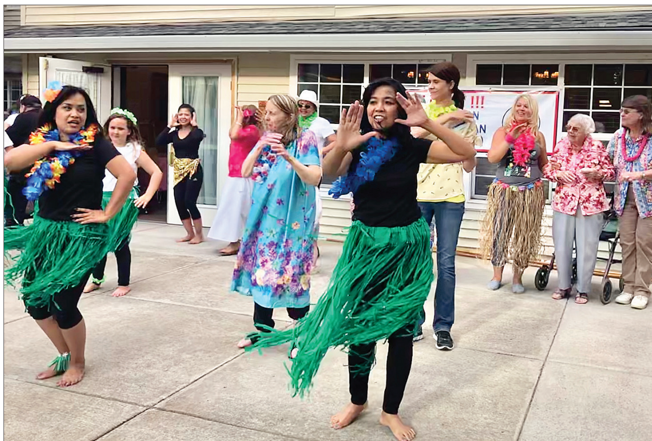
Members of the Eastern Oregon Philippine American Community participate in a dance with staff and residents at McKay Creek Estates in Pendleton.