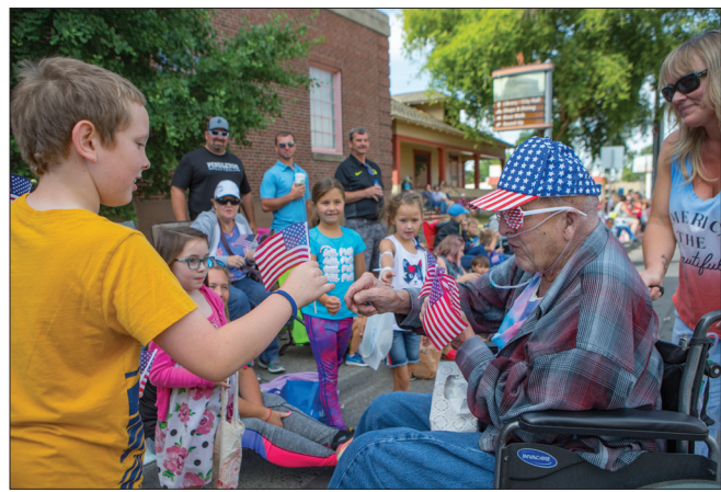
A member of the parade passes out flags to children during the 2019 Pendleton Fourth of July Parade.