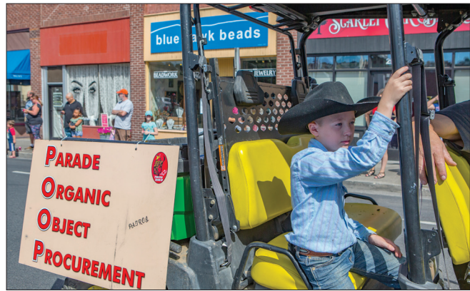
The Parade Organic Object Procurement float follows up behind the horses during the Pendleton Fourth of July parade.