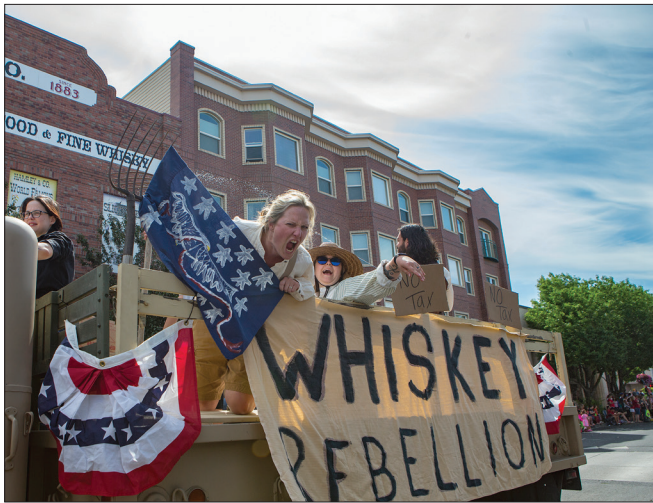
The Pendleton Grain Growers Brand Distillery float waves flags and throws candy at parade-goers.