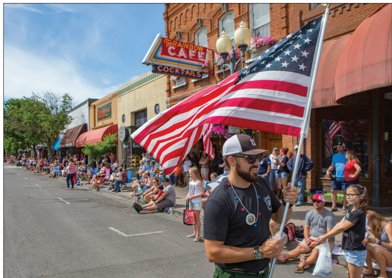
A member of the U.S. Forest Service waves a flag down Main Street during the Pendleton Fourth of July Parade.

P ENDLETON — Celebrating Independence Day is a favorite holiday spent with family and friends, gathered around a barbecue with fireworks to end the day. Another favorite pastime for the Fourth of July is parades. That holds true here in Pendleton, where the city's Fourth of July parade was back as red, white and blue abounded throughout the city's downtown corridor. The parade started at Pendleton City Hall, traveled east on Dorion Avenue to Main Street, then west on Court Avenue to the Pendleton Convention Center. The annual parade is hosted by the VFW "Let 'er Buck" Post 922.