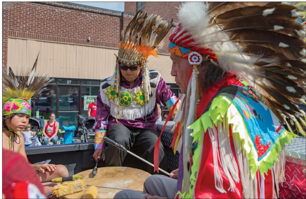
Drummers on the Cultural Club float participate in the Pendleton Fourth of July parade.