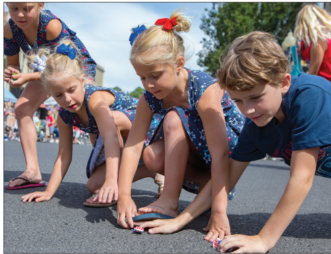
Children run to catch pieces of candy thrown by parade floats during the Pendleton Fourth of July Parade.