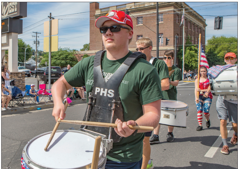
Members of the Pendleton High School marching band perform during the Pendleton Fourth of July Parade.

P ENDLETON — Celebrating Independence Day is a favorite holiday spent with family and friends, gathered around a barbecue with fireworks to end the day. Another favorite pastime for the Fourth of July is parades. That holds true here in Pendleton, where the city's Fourth of July parade was back as red, white and blue abounded throughout the city's downtown corridor. The parade started at Pendleton City Hall, traveled east on Dorion Avenue to Main Street, then west on Court Avenue to the Pendleton Convention Center. The annual parade is hosted by the VFW "Let 'er Buck" Post 922.