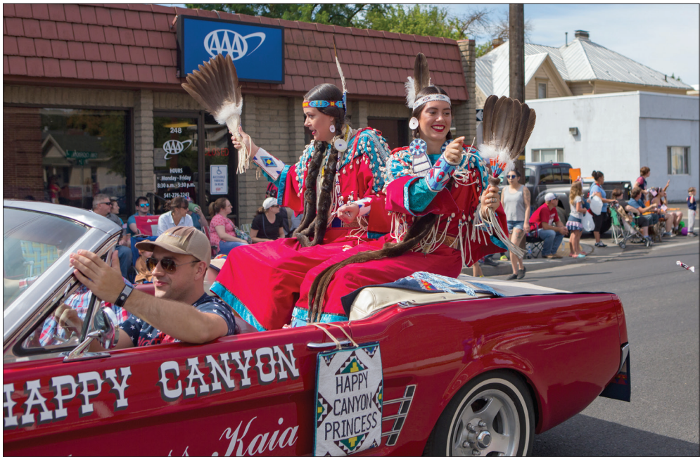
The Happy Canyon Princess float waves to parade-goers at the start of the 2019 Pendleton Fourth of July parade.