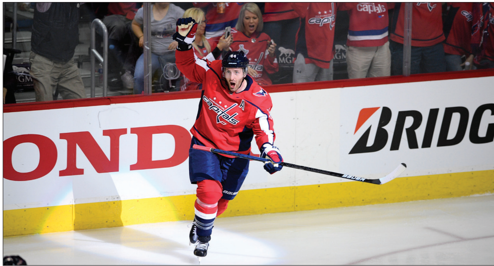
In this April 13, 2019, file photo, Washington Capitals defenseman Brooks Orpik (44) celebrates his game-winning goal in overtime of Game 2 of an NHL hockey first-round playoff series against the Carolina Hurricanes in Washington.

Orpik was back to his vintage self in the playoffs, emptying the tank for 18 minutes a night during the Capitals' seven-game series against Carolina. After