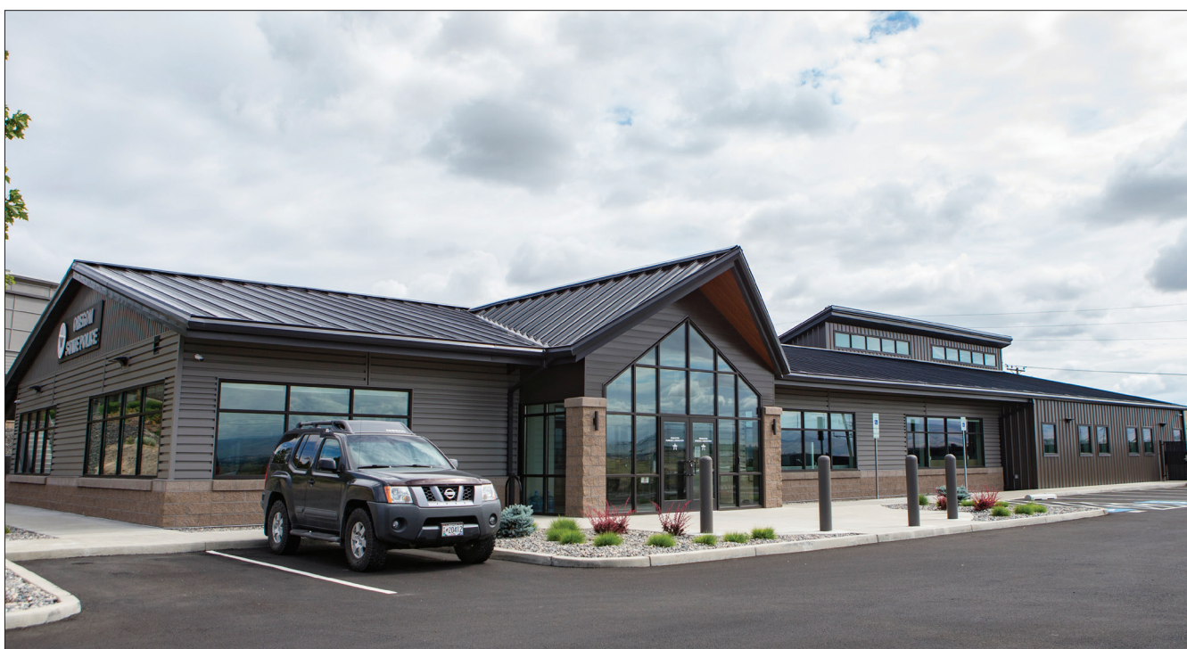
The team at the new Oregon State Police crime lab in Pendleton have the place up and running since moving in May 15, 2019.

State police had options for converting other buildings and spaces into a crime lab, but each came with big downsides. Blue Mountain