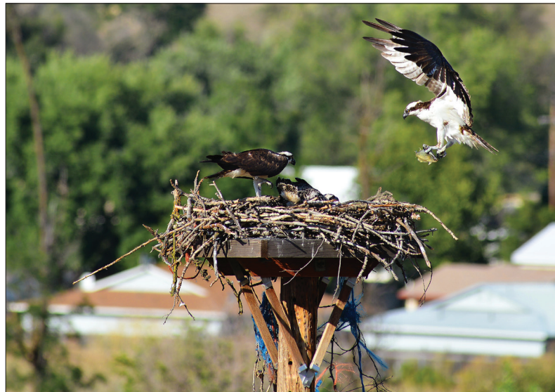
An adult osprey flies up with a fish in its talons to feed its mate and two juveniles in their nest overlooking the Umatilla River on Wednesday, July 6, 2016, in Pendleton.