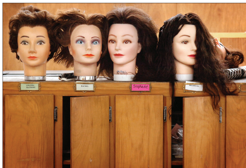
Styling practice heads sit on top of student lockers on Monday, Aug. 2, 2011, at the Pendleton College of Hair Design.