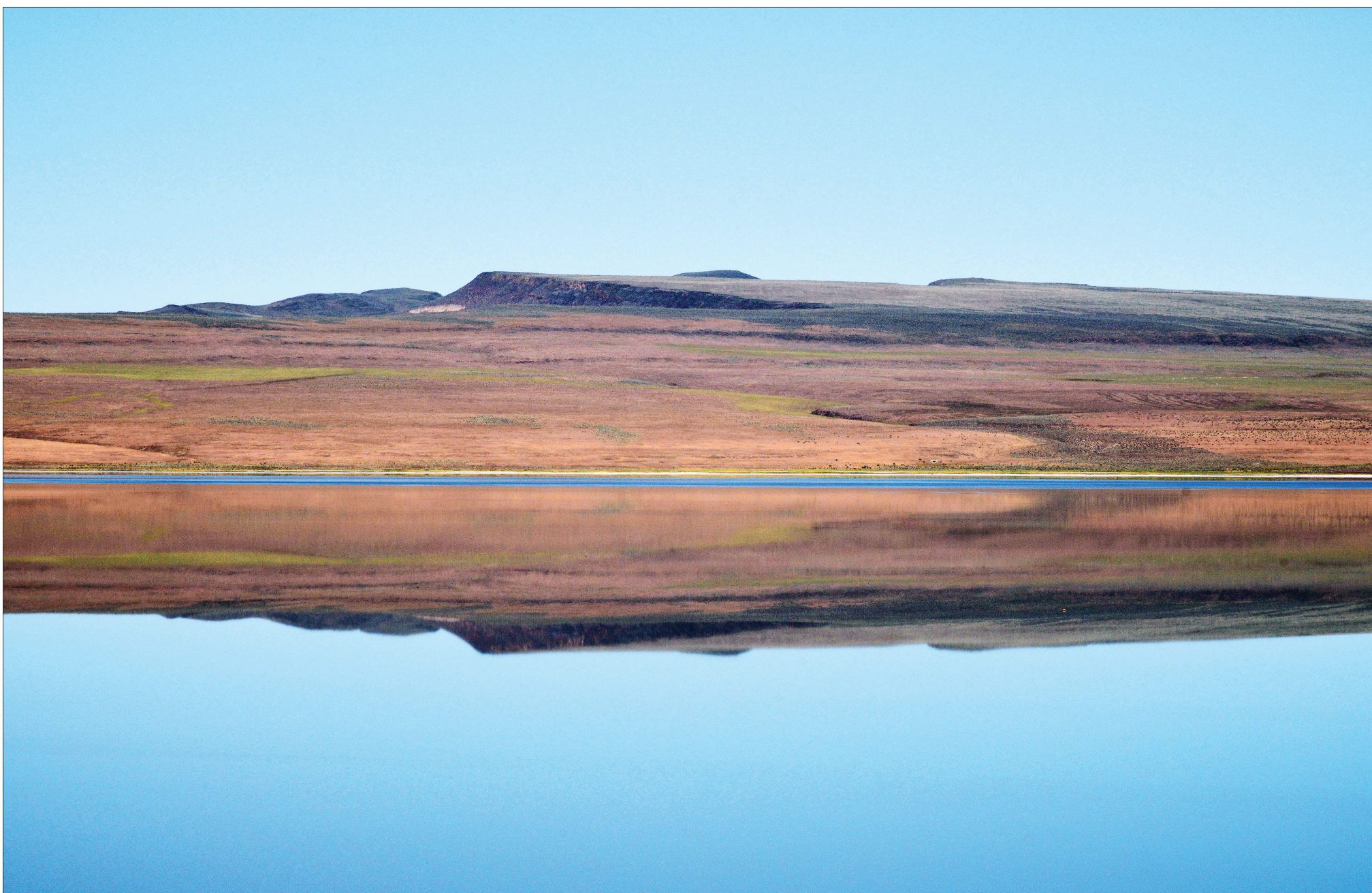
A ridgeline is reflected in the waters of Lake Abert on June 20, 2016, off Highway 395 south of Burns.