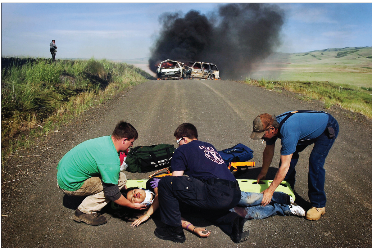
An unidentified victim is loaded onto a backboard at the scene of a deadly two-vehicle collision on North Cayuse Road on the Confederated Tribes of the Umatilla Indian Reservation on May 30, 2012, northeast of Pendleton.