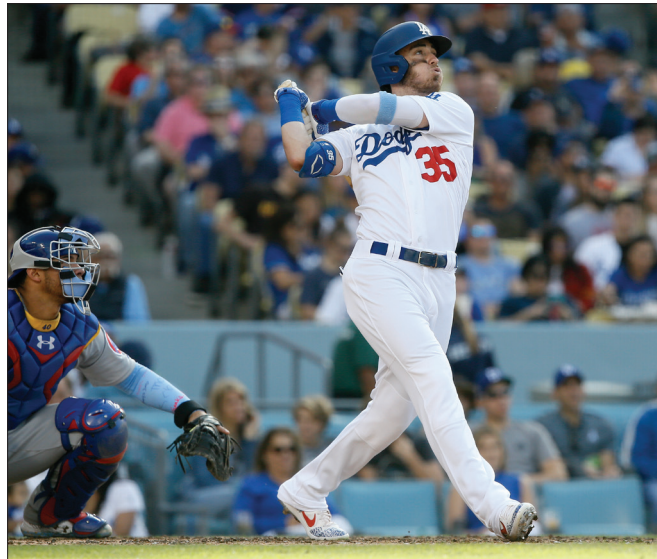
Los Angeles Dodgers' Cody Bellinger, right, watches his solo home run with Chicago Cubs catcher Willson Contreras, left, during the sixth inning of a baseball game in Los Angeles, Sunday, June 16, 2019.

The AP studied the average age for starting All-Star position players since the first Midsummer Classic in 1933, and this year's group is almost certain to be historic, especially in the National League. The average age of the eight NL ballot leaders is just 25, a full year less than the previous youngest starting lineup, the 2017 American League roster.