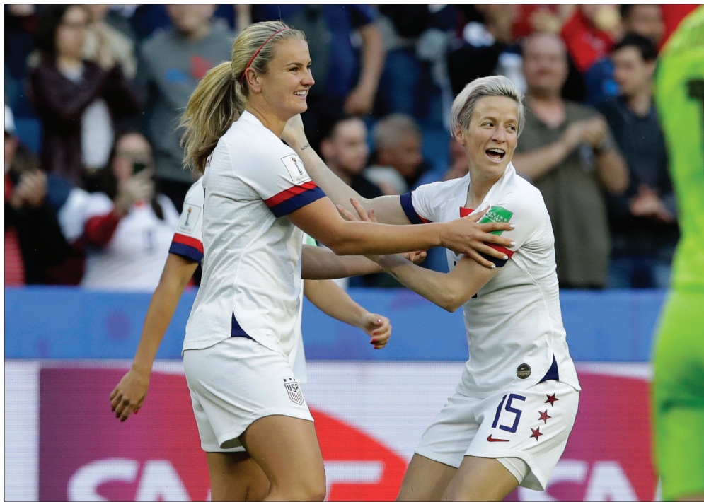
United States' Lindsey Horan, left, is congratulated by teammate Megan Rapinoe, right, after scoring her team's first goal during the Women's World Cup Group F soccer match between Sweden and the United States at Stade Océane, in Le Havre, France on Thursday.