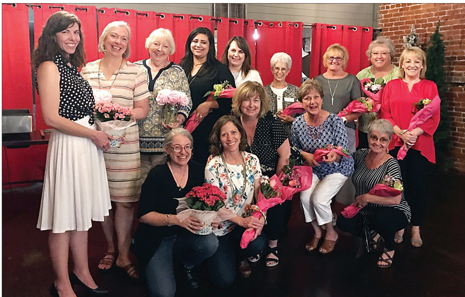
Altrusa International of Pendleton recently installed officers for 2019-20.

For more about the Pendleton club, search Facebook, visit www.districttwelve.altrusa.org or contact altrusapend@gmail.com .