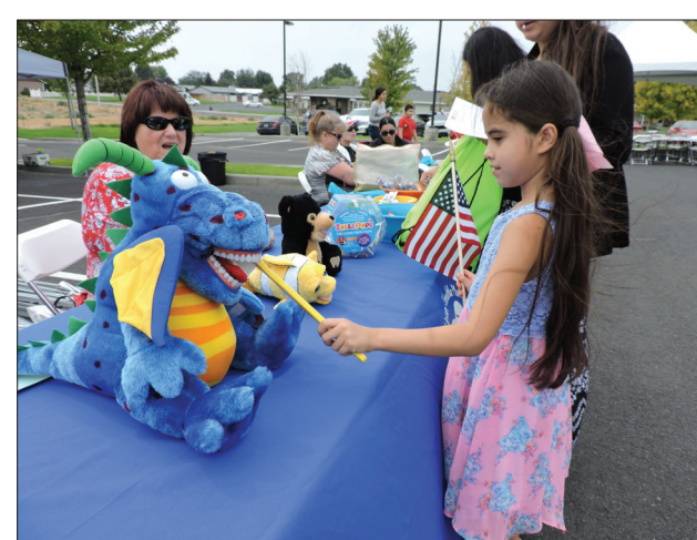
EO File Photo

For more information, search www.oit.edu .