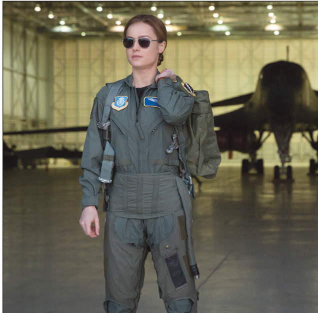
Brie Larson stars in "Captain Marvel"

emotions due to recurring nightmares about a strange woman and an alien planet. After a mission goes horribly wrong, Vers finds herself stranded on Earth,