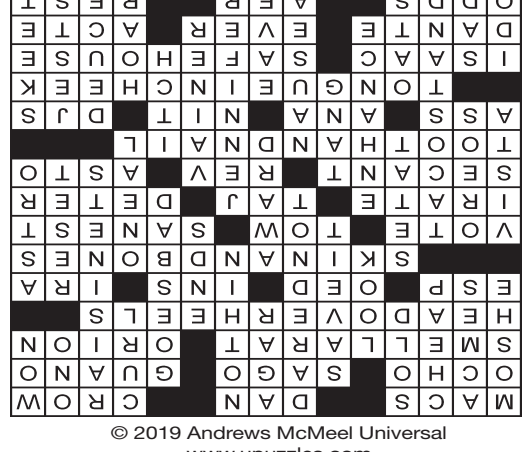
© 2019 Andrews McMeel Universal www.upuzzles.com

40 Drink for astronauts 42 More narcissistic 45 Common early pregnancy symptom 46 Bowling lane button 50 Tie at Wimbledon 51 Speaks jokingly 52 Clay target shooting 54 Cheerios ingredients 55 Roof overhang 56 Frost 57 Vow hidden in "maid of honor" 58 Blue