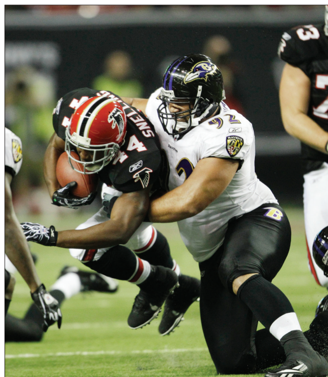
In this Nov. 11, 2010, file photo, Atlanta Falcons running back Jason Snelling (44) is stopped by Baltimore Ravens defensive tackle Haloti Ngata (92) in an NFL football game in Atlanta. Ngata came into the NFL with Baltimore and will leave as a member of the Ravens, the team that provided him with his best memories and a Super Bowl ring.

Wiping away tears, Ngata told an audience of family, friends, former teammates and fans, "This is an amazing organization. I loved being a Raven. I always knew I wanted to retire as a Raven. I just couldn't wait to