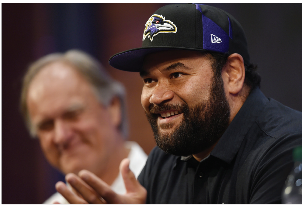
Former Baltimore Ravens NFL football player Haloti Ngata, right, speaks about his retirement during a news conference with former head coach Brian Billick, left, on Wednesday in Owings Mills, Md.

Ngata, 35, will also have his name emblazoned on the Ravens' home stadium, a suitable salute to a five-time Pro Bowl defensive tackle who made a name