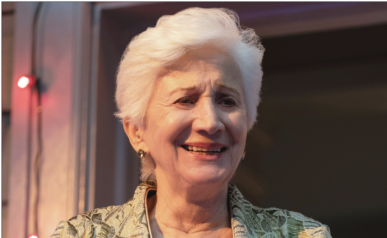
Olympia Dukakis in "Armistead Maupin's Tales of the City"