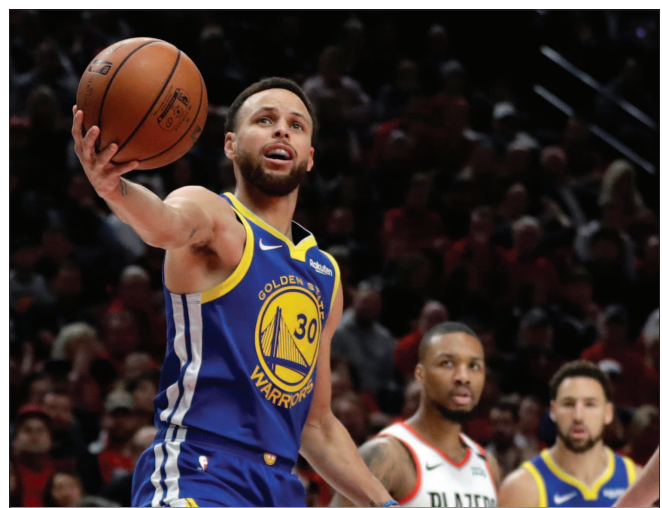
Golden State Warriors guard Stephen Curry (30) holds the ball after being whistled for a penalty during the first half of Game 4 of the NBA Western Conference Finals against the Trail Blazers on Monday in Portland.

you can imagine. So we relied on that,” Curry said. Playing without Kevin Durant, Andre Iguodala and DeMarcus Cousins, the Warriors became the first team to reach five straight finals since the Boston Celtics went to 10 in a row from 1957-66. Damian Lillard, playing with separated ribs, had 28 points and 12 assists for Portland. He missed a 3-point attempt as time ran out in the extra period. Meyers Leonard added a career-high 30 points along with 12 rebounds.