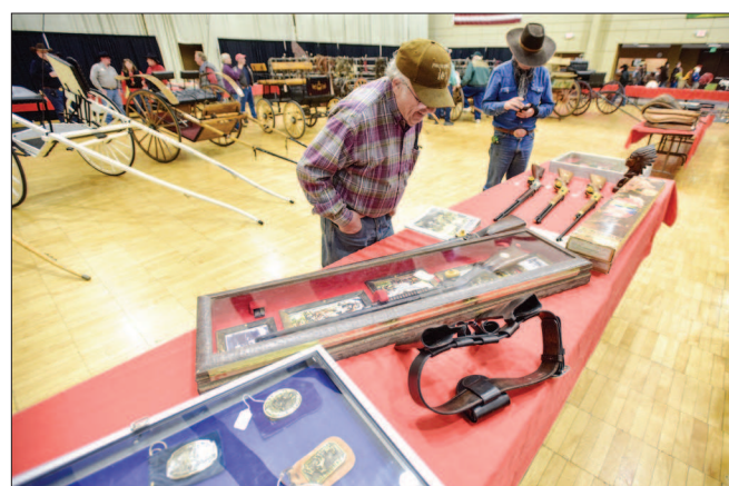
Buyers look at a table of firearms up for auction at the Westward Ho! Wagon and Western Memorabilia Auction on Friday in Pendleton.