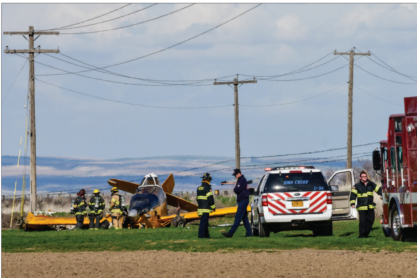
Hermiston Fire District 1 firefighters respond to a crashed crop duster Thursday in a field south of Hermiston. The pilot of the aircraft was taken to Good Shepherd Medical Center with minor injuries.