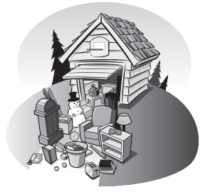
GARAGE SALE? Advertise it here in the classifieds!