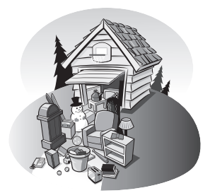
GARAGE SALE? Advertise it here in the classifieds!

Looking for a new place to live? The classified ads offer a complete section of homes, apartments, and mobile homes to fit your needs. Check daily for new listings!