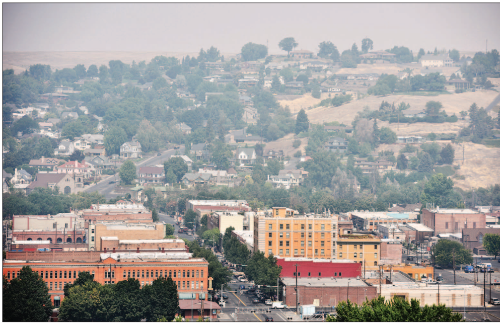
A haze hangs over downtown Pendleton on Aug. 14, 2018, as smoke from regional wildfires has inundated the region.

“This change will allow relatively low levels of smoke from prescribed burning to occur more frequently in communities. And that’s a tradeoff for reducing the potential for much worse smoke incidence from wildfire in the summer season,”