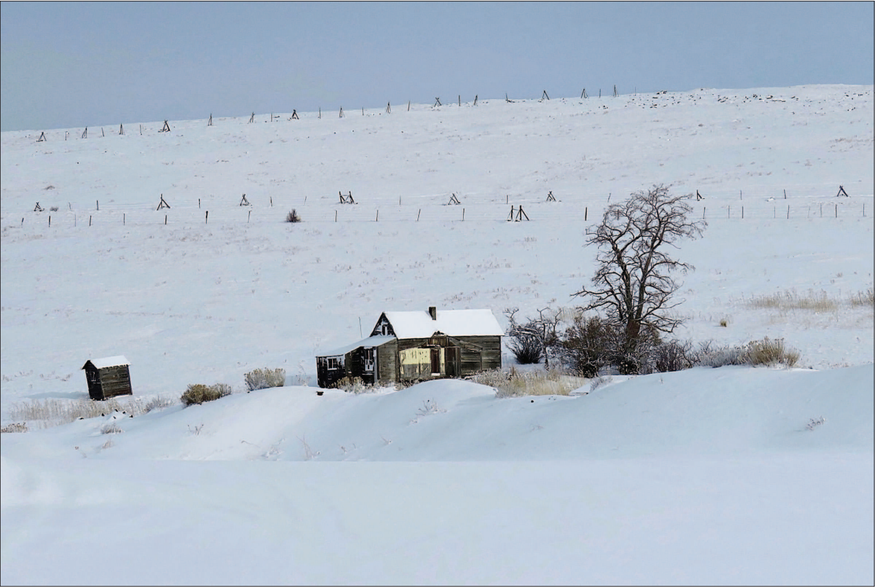
Snow covers the hillside and an old house in the Blue Mountains south of Pilot Rock.