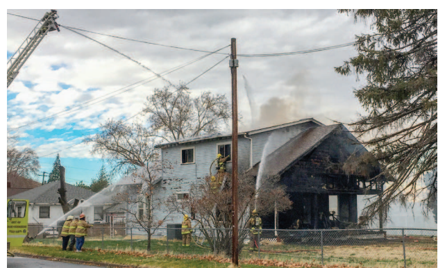
A fire destroyed a house at 618 S. Columbia St. in Milton-Freewater on Tuesday.