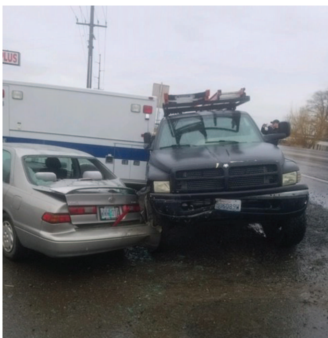
A crash Tuesday in Umatilla likely damaged the frame of the former ambulance — behind the sedan and pickup — which the Hermiston Police Department planned to turn into a vehicle for gathering evidence at certain crime scenes.

Hermiston police sent the ambulance to a Tri-Cities business to give it a