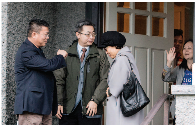
Huawei chief financial officer Meng Wanzhou, right, waves goodbye to visitors at her home in Vancouver on Wednesday.

The comment suggests Meng could be a political pawn in negotiations and makes things more awkward for Canada, which arrested her on America's behalf during a Dec. 1 layover at the