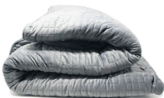
My Calm Blanket via AP

A mature Queen Victoria Agave plant grown from seeds sold by the Etsy shop SmartSeedsEmporium. With a spiral of deep green leaves, the plant grows slowly and can reach a foot tall and wide.