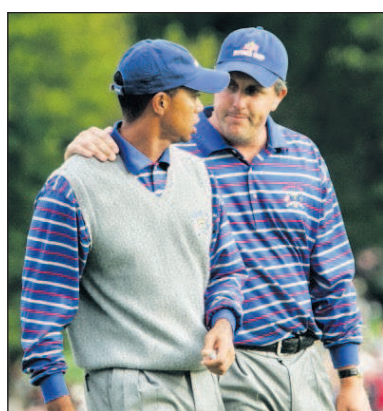
In this Sept. 17, 2004, file photo, U.S. team player Phil Mickelson puts his arm around partner Tiger Woods as they walk off the 18th green after they lost to Europeans Darren Clarke and Lee Westwood on the final hole of their foursomes match at the 35th Ryder Cup. They play a high-stakes exhibition Friday in Las Vegas in golf's first venture using pay-per-view.

There will be plenty of talking, and Mickelson is rarely without words. There will be side action. That's part of what makes this different from the "Showdown at Sherwood," a Monday night exhibition between Woods and David Duval in 1999 when they were in their prime and battling for No. 1 in the world.