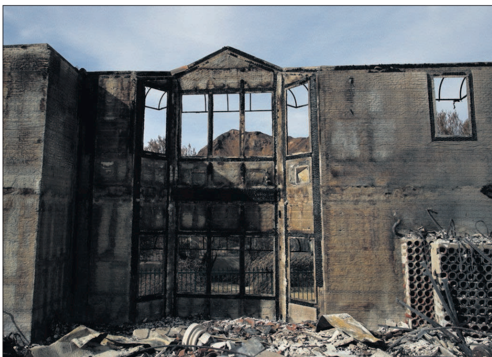
A mountain is seen through charred window frames of a mansion burned down by the Woolsey Fire on Tuesday in Agoura Hills, Calif.

The number of homes and other structures destroyed was 435. Damage assessment was con-