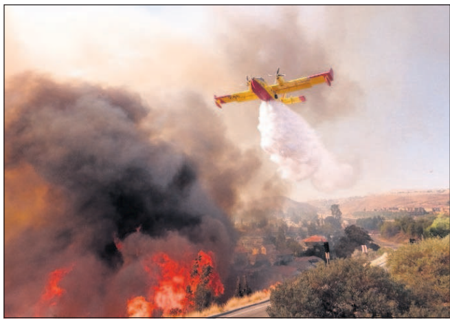
Left: An air tanker drops water on a fire along the Ronald Reagan (118) Freeway in Simi Valley, Calif., on Monday.