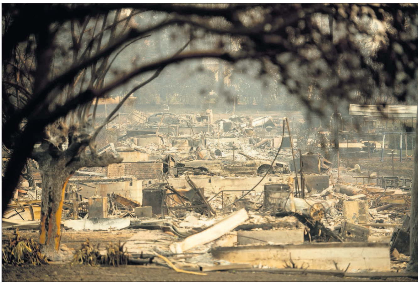
Leveled residences line a block following the Camp Fire in Paradise, Calif., on Monday.