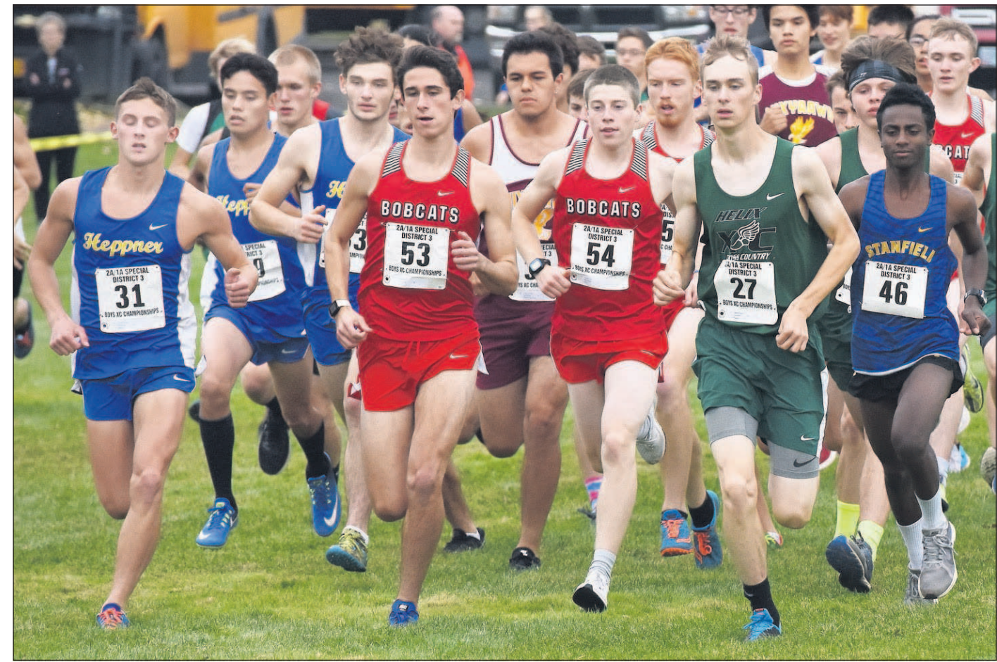
The Heppner cross-country team, left, runs at the start of the Special District 3 cross-country meet on Oct. 26 in Pendleton.

The Mustangs head to their first state meet