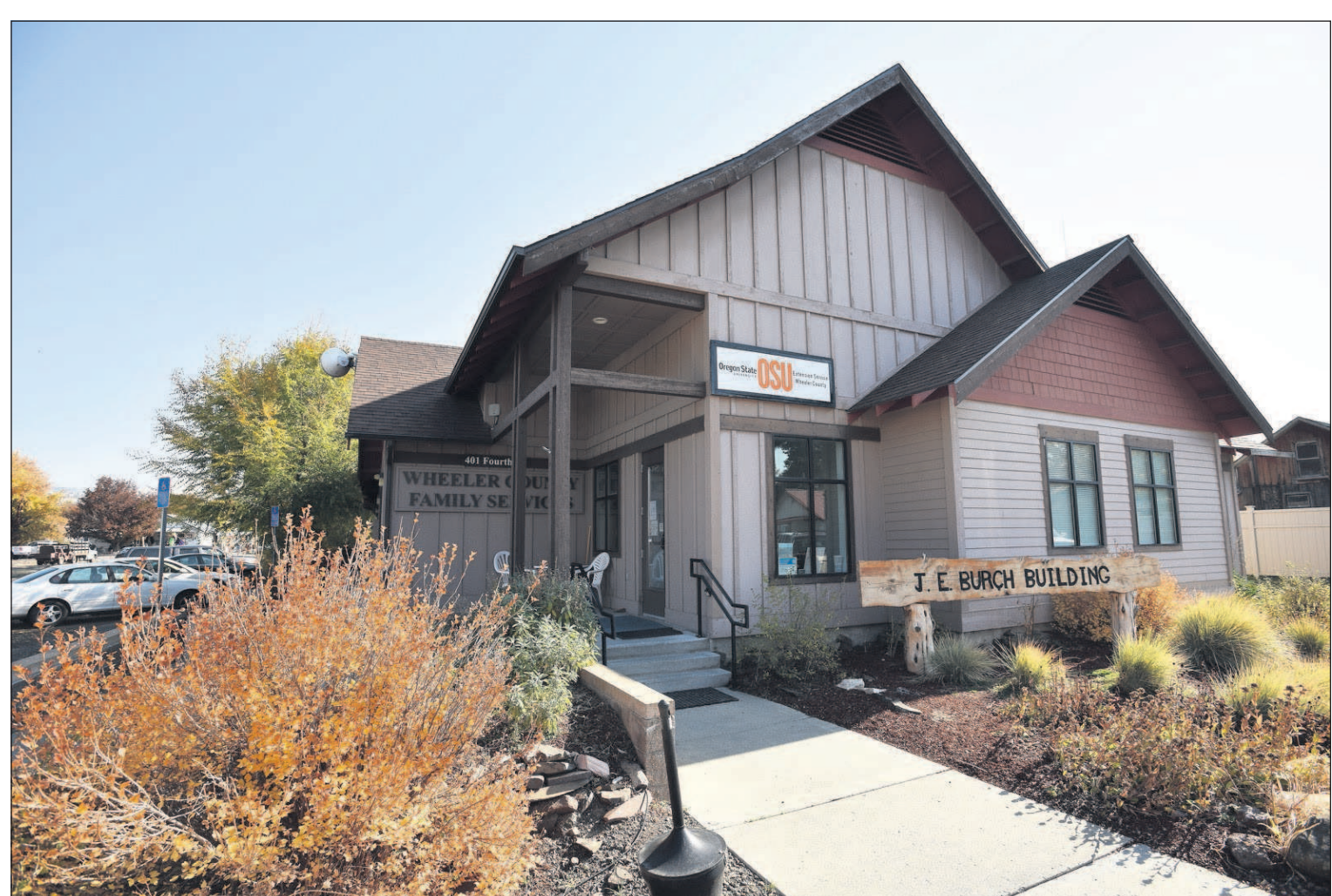
The Oregon Department of Revenue has recently opened at call center in the J.E. Burch Building in Fossil.

Six people will handle calls out of Wheeler County office