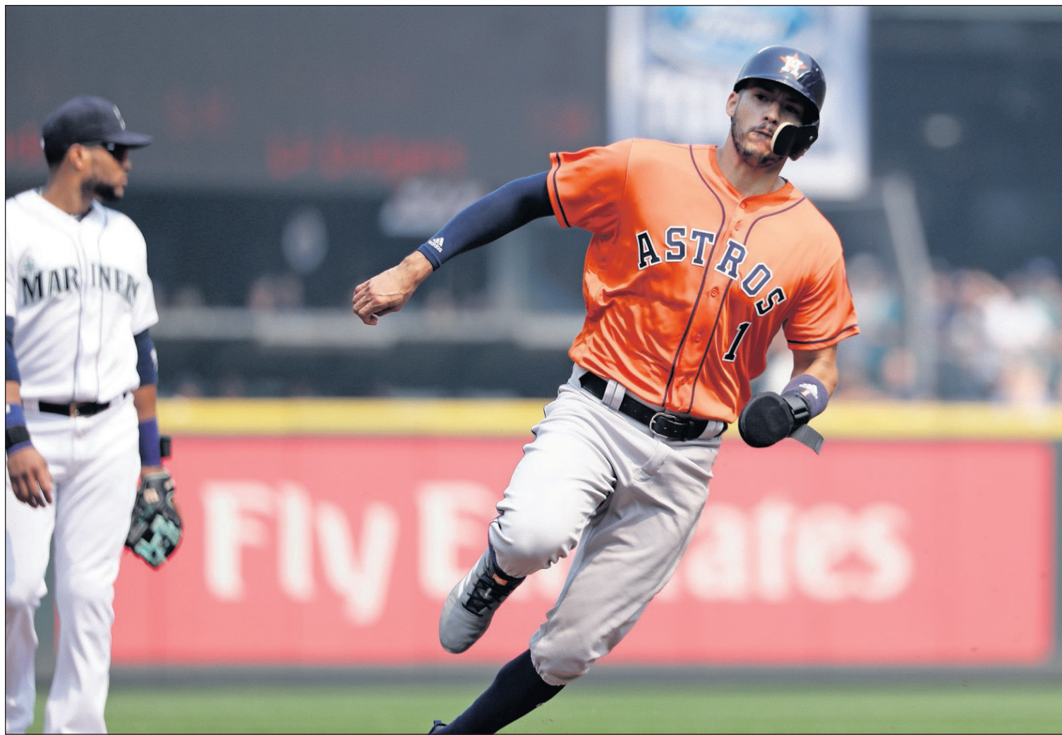
Houston Astros' Carlos Correa (1) races past Seattle Mariners third baseman Robinson Cano to score in the first inning.