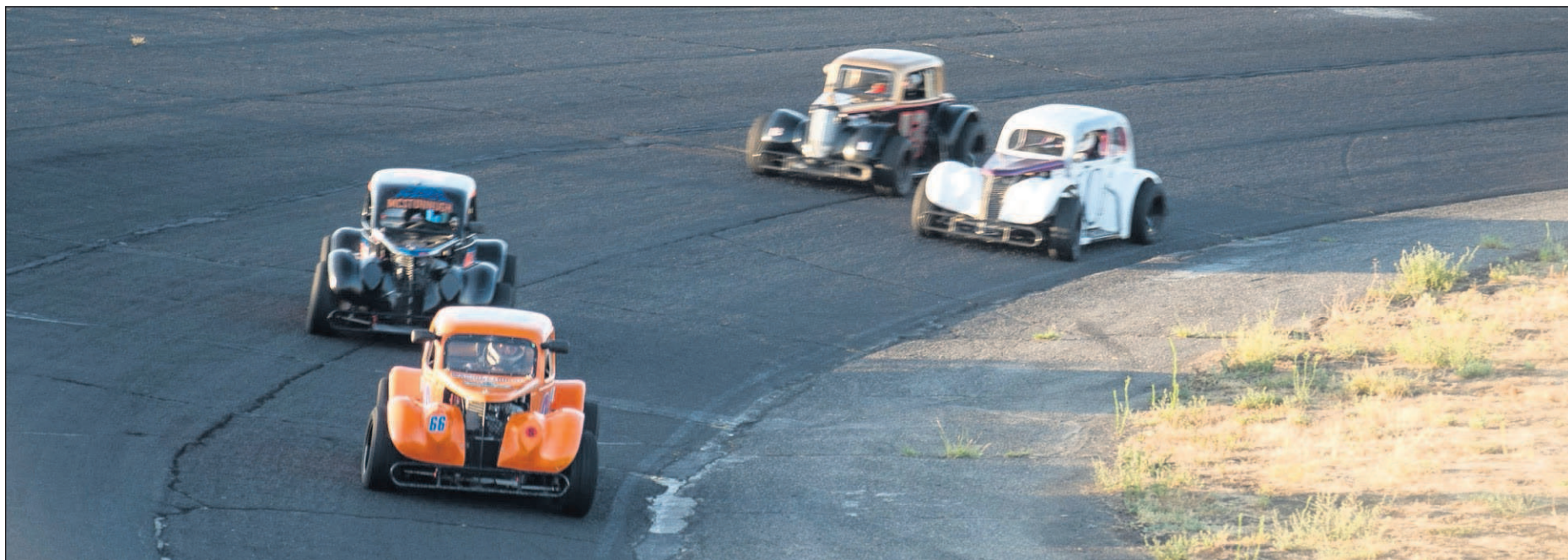
The Columbia River Legends division compete in a heat race at the Hermiston Raceway on Saturday evening.