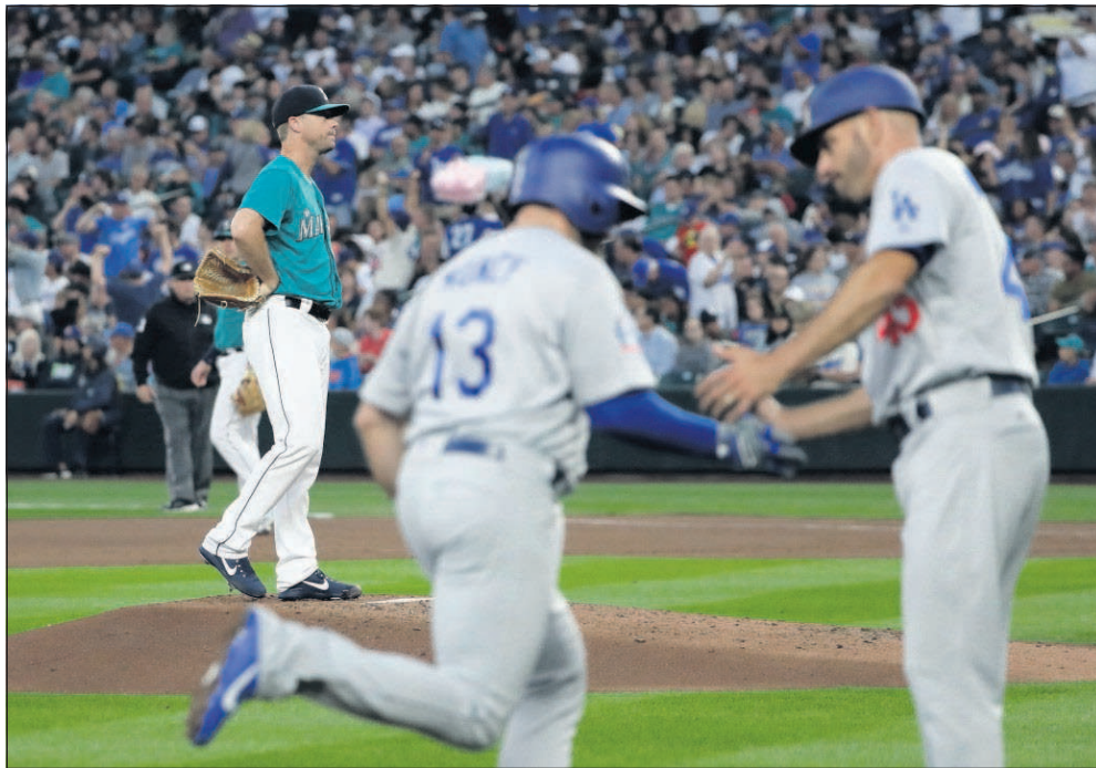
Seattle Mariners starting pitcher Wade LeBlanc, left, stands on the mound as Los Angeles Dodgers' Max Muncy (13) is greeted by third base coach Chris Woodward.

Dodgers: RHP Erik Goeddel was placed on the 10-day disabled list with elbow inflammation on Friday. It's his second stint on the DL in just the past few weeks. Goeddel was activated off the disabled list last Monday after missing time with a lat injury. The Dodgers reinstated right-