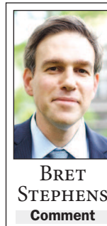
BRET STEPHENS Comment

On the contrary, I'll be the first to acknowledge that we urgently need to have a national conversation about all this,