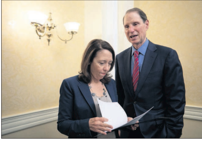
Sen. Maria Cantwell, D-Wash., left, and Sen. Ron Wyden, D-Ore., attend a news conference with Secretary of Agriculture Sonny Perdue to discuss ways to improve the health of the forests and how to reduce wildfires, on Capitol Hill in Washington, Thursday, Aug. 16, 2018.

Perdue pledged a "shared stewardship" approach in which the Forest Service, Bureau of Land Management and other federal agencies work with state, local and tribal officials to