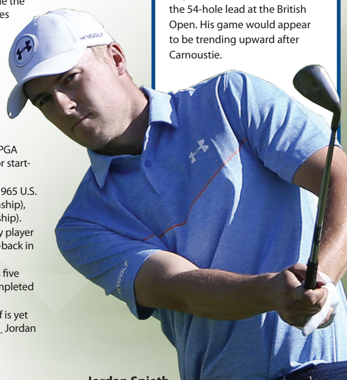
Jordan Spieth bid for career Grand Slam

lead at the British Open in the final round and finished in a tie for sixth. He will try to tie the record for most PGA Championship titles (five) held by Jack Nicklaus and Walter Hagen. Ryder Cup: The PGA Championship is the final event for players to finish among the top eight qualifiers for the U.S. Ryder Cup team. With points counting double and a big purse, the winner is virtually assured a spot on the team. Last shot at Glory's Last Shot: The PGA Championship will be the second major starting next year when it moves to May. Bellerive champions: Gary Player (1965 U.S. Open), Nick Price (1992 PGA Championship), Camilo Villegas (2008 BMW Championship). Key statistic: Tiger Woods is the only player to win the PGA Championship back-to-back in stroke play. Woods did it twice. Worth noting: None of the previous five players with the career Grand Slam completed it at the PGA Championship. Worth quoting: "I think my best golf is yet to come, which is cool to think about." — Jordan Spieth.