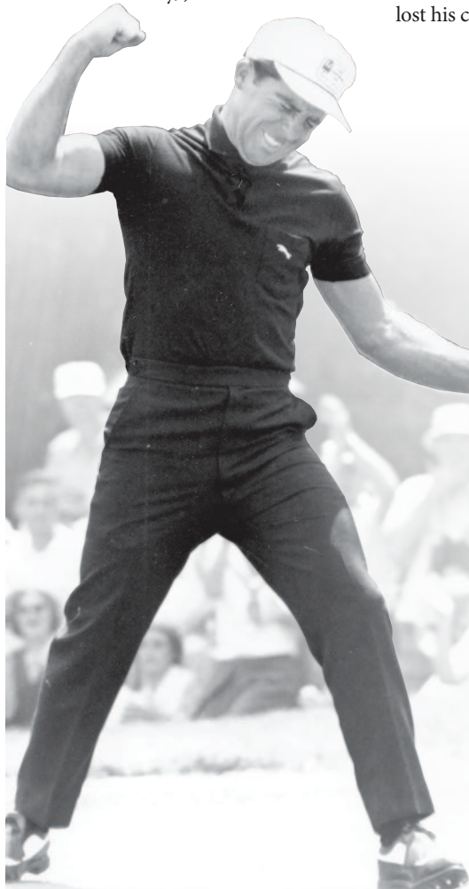
Gary Player • career Grand Slam in 1965

Golf at the highest level has been held at Bellerive twice during Woods' career, yet his only time playing the course was a practice round with Mark Calcavecchia for the American Express Championship. That was on Tuesday, Sept. 11, 2001, and the World Golf Championship was canceled the next day. A couple of years later, Bellerive was awarded the 2008 BMW Championship, the third FedEx Cup playoff event. That was the year Woods won the U.S. Open and had season-ending surgery on his left knee a week later. Maybe the third time is a charm for Woods in St. Louis.