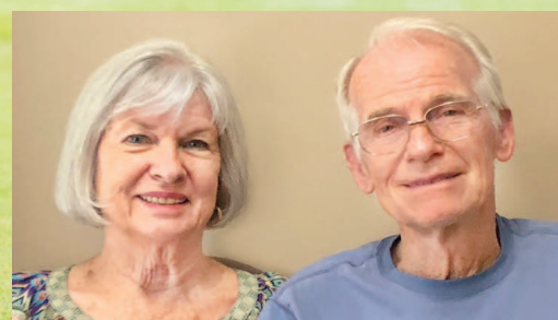
Back, Neck, & Shoulders

"My wife and I were very impressed with the results from the stem cell injections. I would definitely do it over again if I ever need to." ~ James