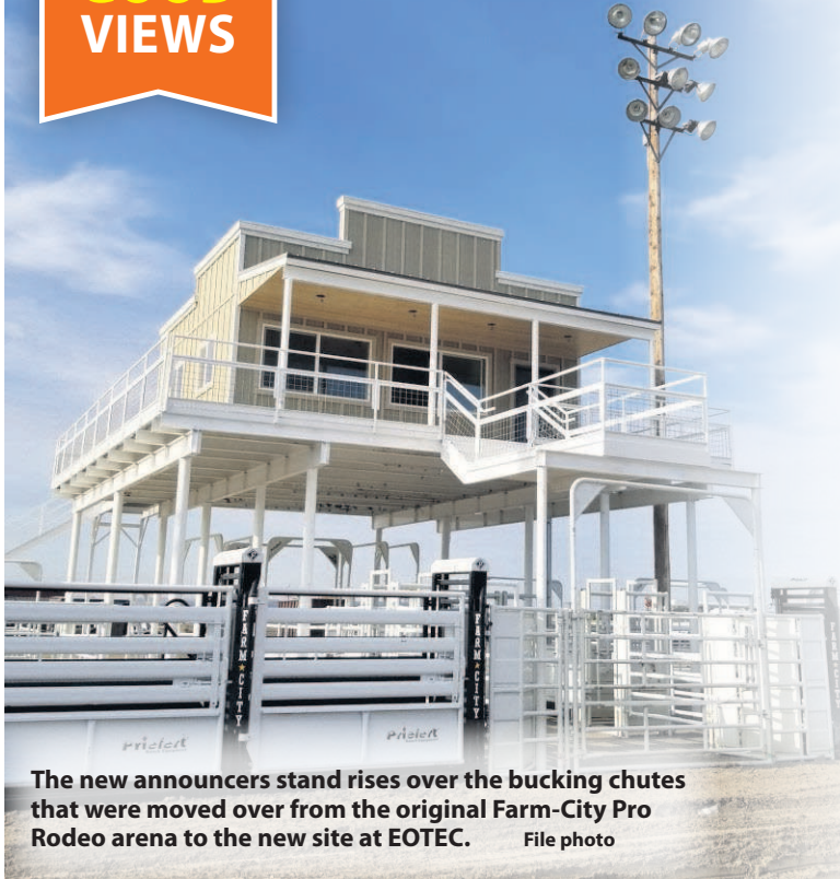
The new announcers stand rises over the bucking chutes that were moved over from the original Farm-City Pro Rodeo arena to the new site at EOTEC. File photo

R odeo-goers can anticipate a new and improved environment at Farm-City this year.