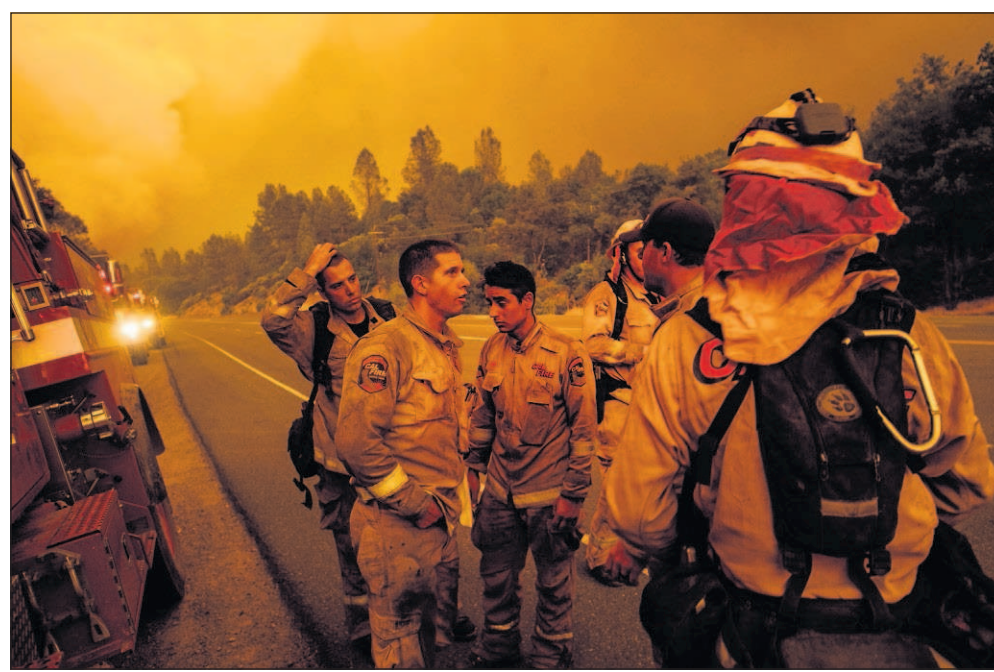
Firefighters discuss plans while battling the Carr Fire in Shasta, Calif., on Thursday.

Fire officials warned that the blaze would probably burn deeper into urban areas