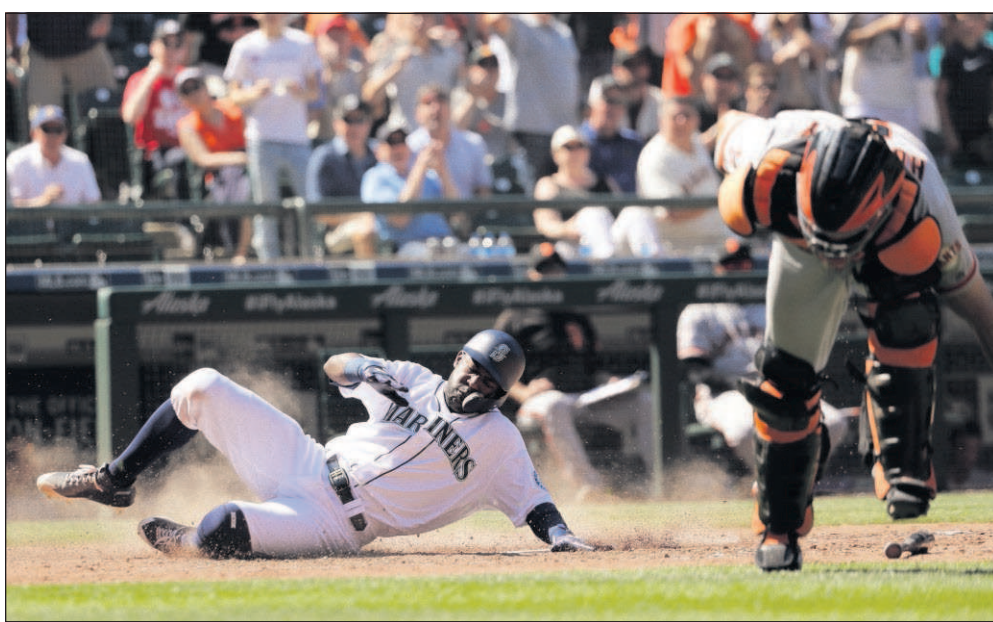
Seattle Mariners' Guillermo Heredia slides past San Francisco Giants catcher Nick Hundley to score during the eighth inning of a baseball game Wednesday, July 25, 2018, in Seattle. The Mariners won 3-2.