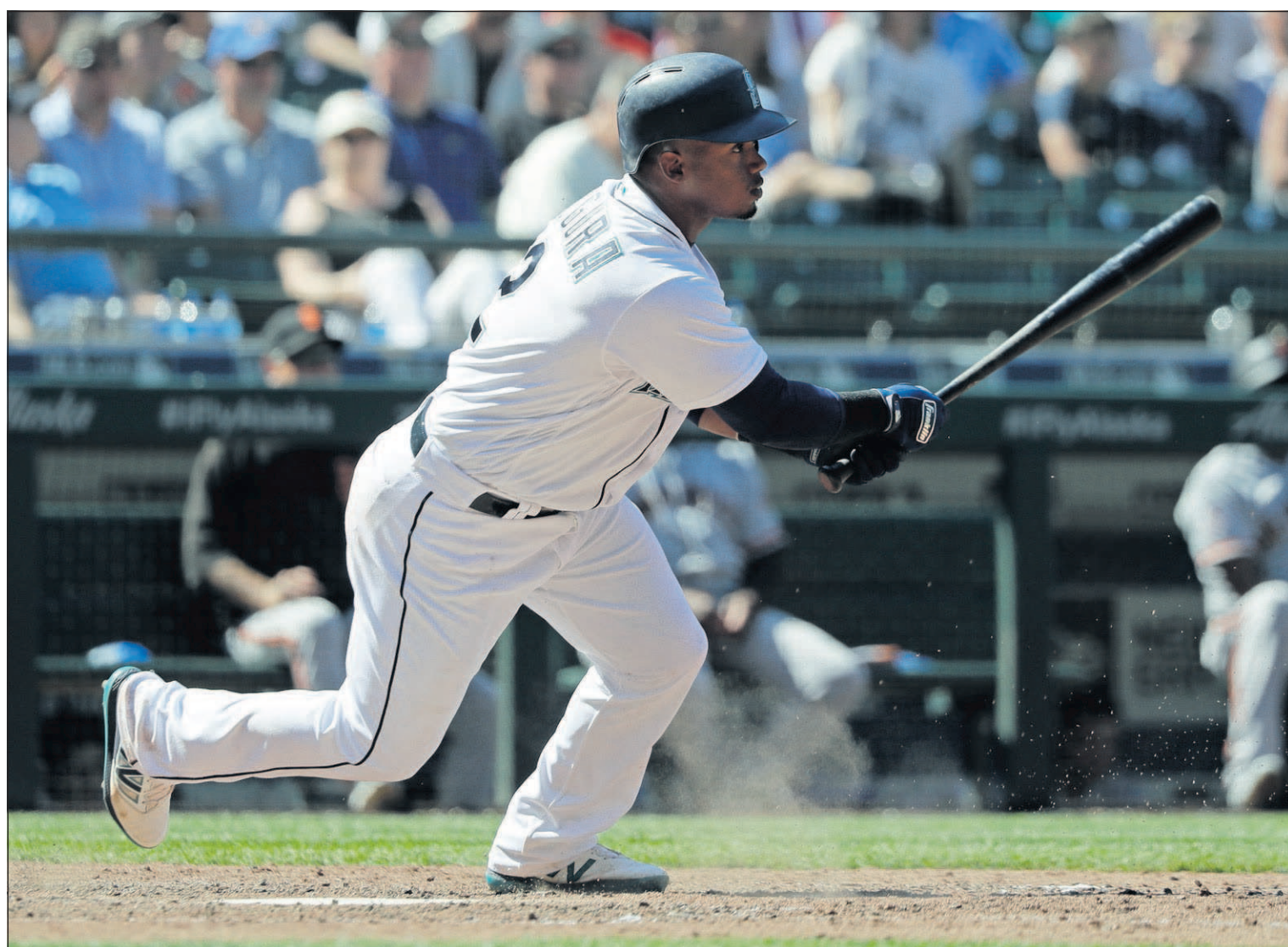
Seattle Mariners' Jean Segura watches his tie-breaking RBI single during the eighth inning of a baseball game against the San Francisco Giants, Wednesday, July 25, 2018, in Seattle. The Mariners won 3-2.