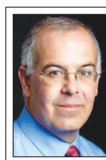
DAVID BROOKS Comment

In brief, Democrats have stayed away from this narrative because the long hoped-for alliance between oppressed racial minorities and the oppressed white working class has never materialized, and it looks very far from materializing now.