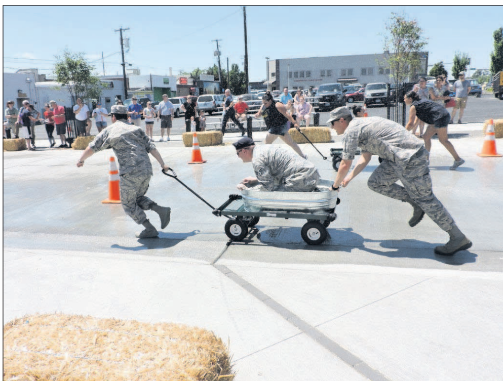
Members of the U.S. Air Force team compete against Amo ser Latina during the Splash and Dash at Funfest in downtown Hermiston on Saturday.