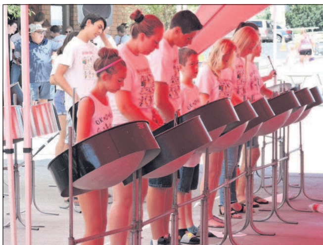
The Bram Brata Steel Drum Band performs on the new festival street at Funfest.