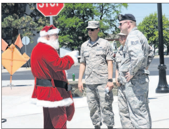
Santa Claus gives the Air Force Splash and Dash team a pep talk before the races on the new festival street at Funfest on Saturday.