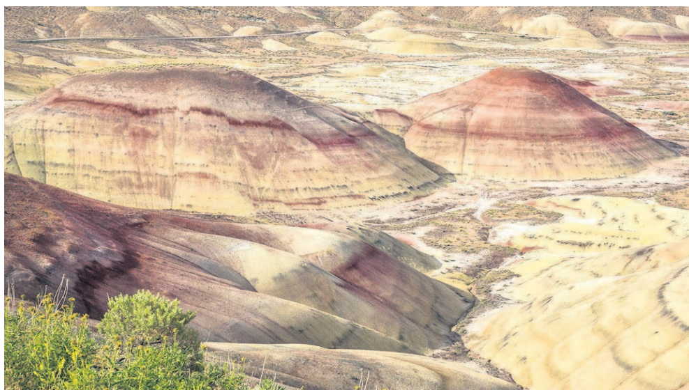
The number of visitors to the Painted Hills have jumped considerably in recent years, taxing public safety and law enforcement resources in rural Wheeler County.