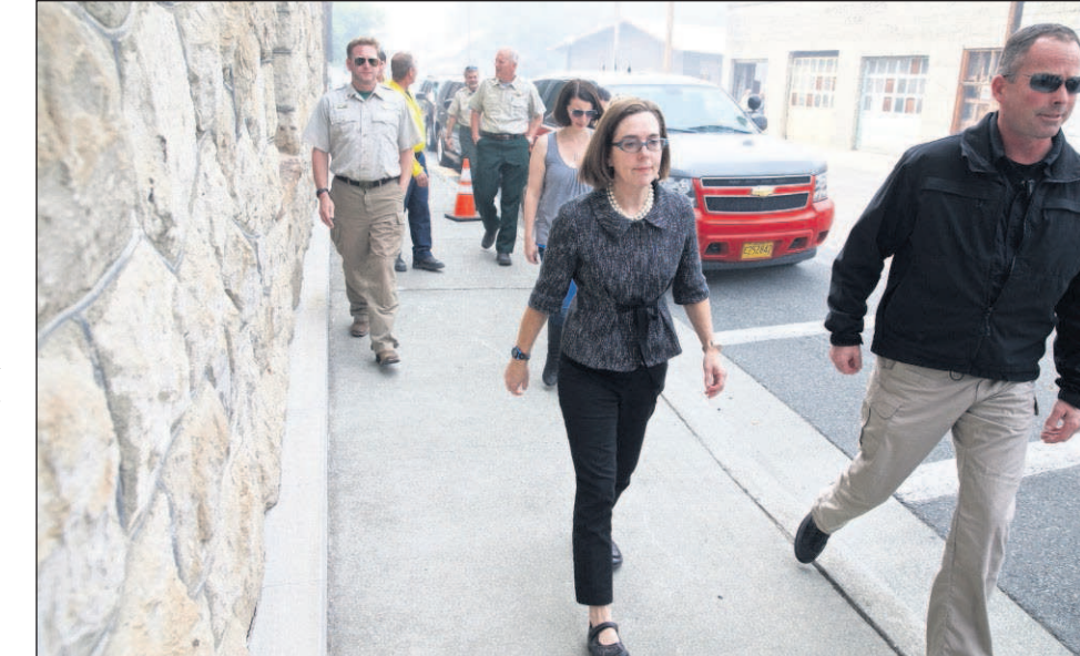
In this 2015 photo, a special unit of the Oregon State Police guards Gov. Kate Brown on a trip to meet with homeowners in Canyon City who lost their homes to the Canyon Creek Complex fire.