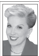
JEANNE PHILLIPS Advice