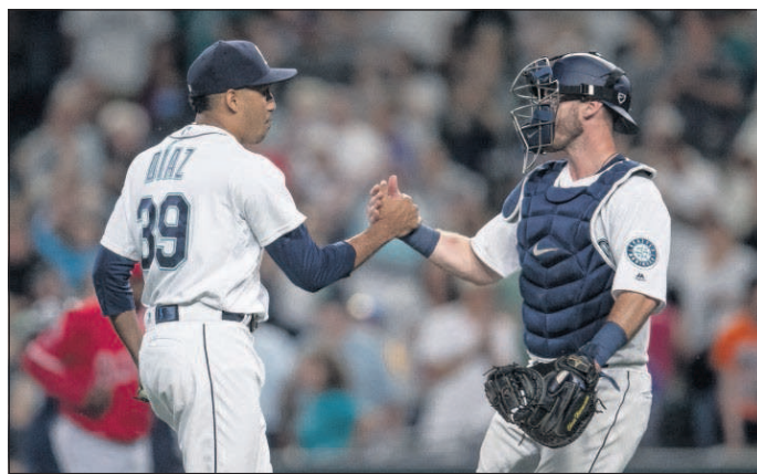
Seattle Mariners relief pitcher Edwin Diaz, left, and catcher Chris Herrmann celebrate after a baseball game against the Los Angeles Angels on Thursday in Seattle. The Mariners won the game 4-1.

mann's solo blast off reliever Miguel Almonte carried deep into the right-field bleachers. Dee Gordon tripled into the right-field corner with two outs, and Jean Segura greeted reliever Cam Bedrosian with a high-chopping RBI single to third baseman David Fletcher to extend Seattle's lead to 4-1.