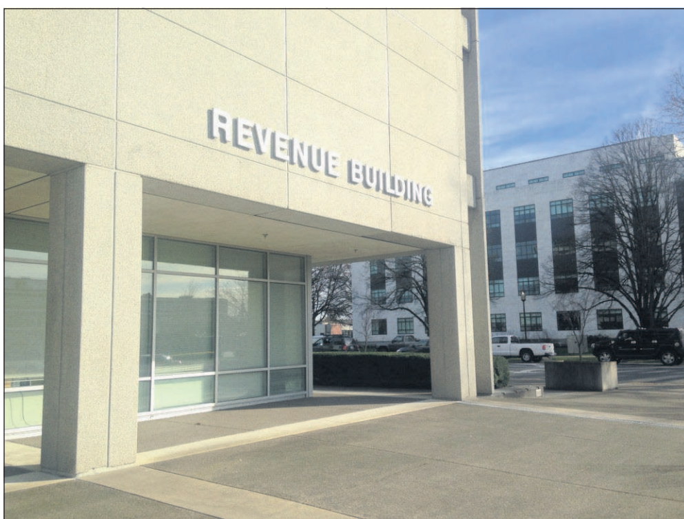
About 41.6 percent of Oregon's state and local taxes came from the state income tax in 2015, according to the analysis from the Washington, D.C.-based Tax Foundation.