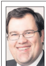
SCOTT A. OLSON Comment

Granted, the size of a trade relationship shouldn't be decisive of