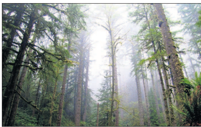
The Oregon Department of State Lands is investigating whether counties or private entities might more cheaply manage Common School Fund forest land. The Elliott State Forest, pictured here, is part of that land.