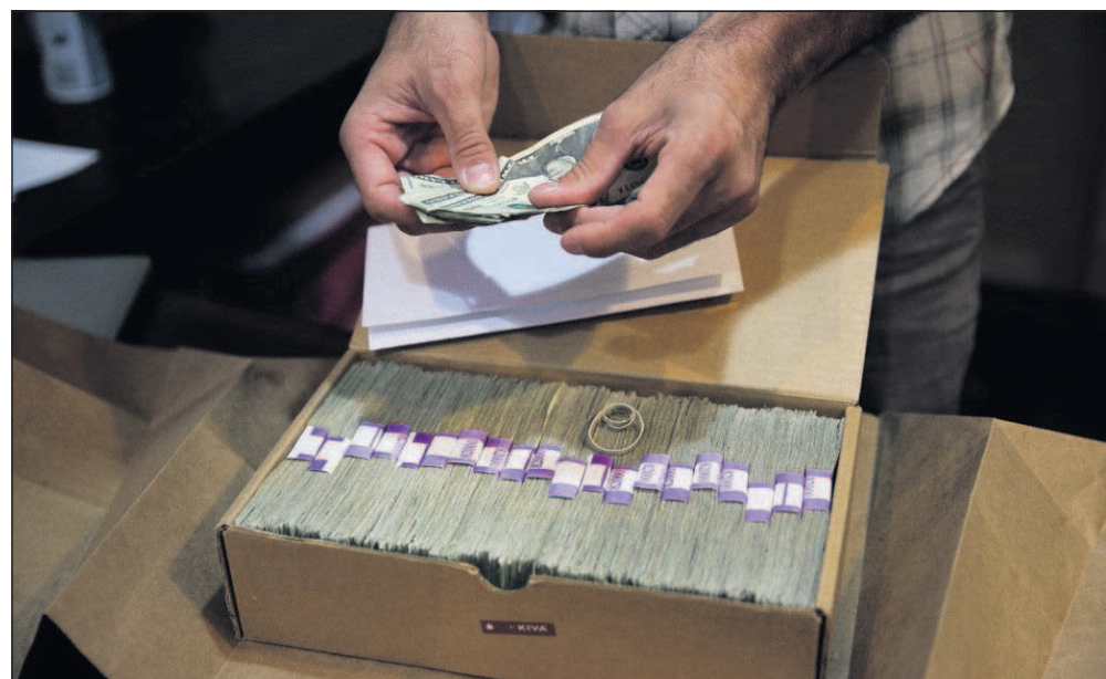
The proprietor of a medical marijuana dispensary prepares his monthly tax payment, over $40,000 in cash, at his Los Angeles store.

LOS ANGELES (AP) — A proposal in Congress to ease the U.S. ban on marijuana could encourage more banks to do business with cannabis companies, but it appears to fall short of a cure-all for an industry that must operate mainly as a cash business in a credit card world.